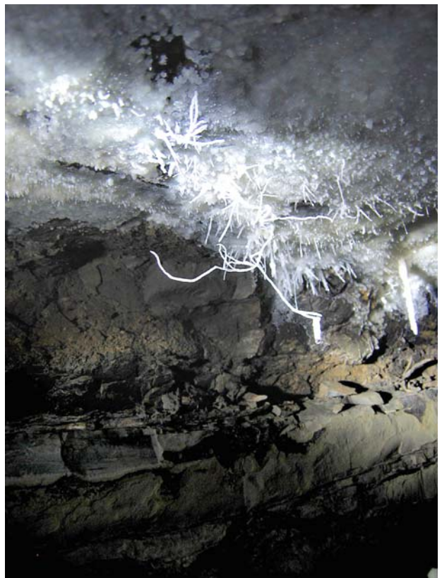
Photos pages 15 and 16 of Helibeds formations